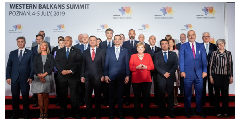
2019 Western Balkans Summit, Poznań, Poland.

Out of all the Visegrad Group countries (also known as the Visegrad Four, or V4), Poland is the most geographically distant from the Western Balkan region. However, since joining the European Union in 2004, Warsaw has been pursuing an active policy aimed at helping the new EU candidate countries. Direct political interests and both the attention of the media as well as the public opinion in Poland have all been largely focused on supporting the countries directly bordering Poland, in particular Ukraine. However, it is worth noting that the Polish Presidency in the Berlin Process has recently contributed greatly to increasing public awareness about the Western Balkans among the Polish people.